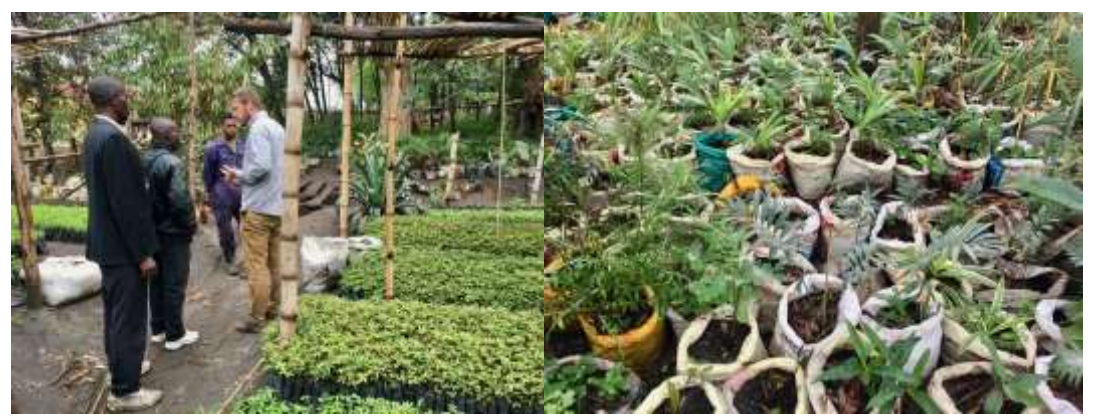
Buying trees in the tree nursery in Kasese for the planting day in Kikorongo village in Uganda

Preparing the planting day: <u>https://www.youtube.com/watch?v=eenfzMW4kC0</u> Digging holes: <u>https://youtu.be/k5Aa87CpE3M</u> Planting the trees: <u>https://www.youtube.com/watch?v=kftMHQ8QVal</u> There is music in trees! During the tree planting day this song came up: <u>https://www.youtube.com/watch?v=p4CmcbNJL_A</u>