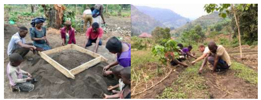
Preparing soil for planting and weeding in the tree nursery in Ruboni village in Uganda