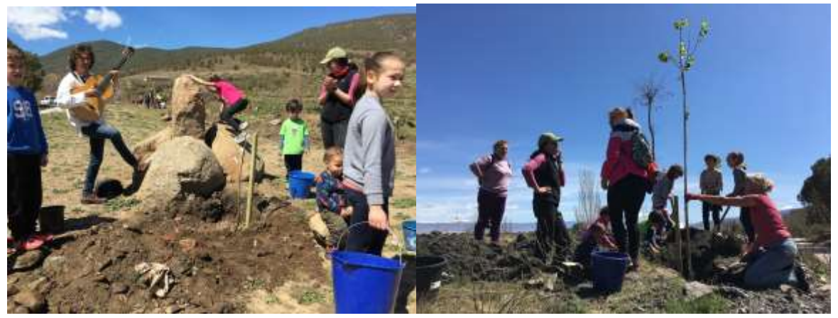
Planting trees and enjoying live music during the planting day in Jerez del Marquesado in Spain

Video link: <a href="https://www.youtube.com/watch?v=x-z2UvHcRWc">https://www.youtube.com/watch?v=x-z2UvHcRWc</a>