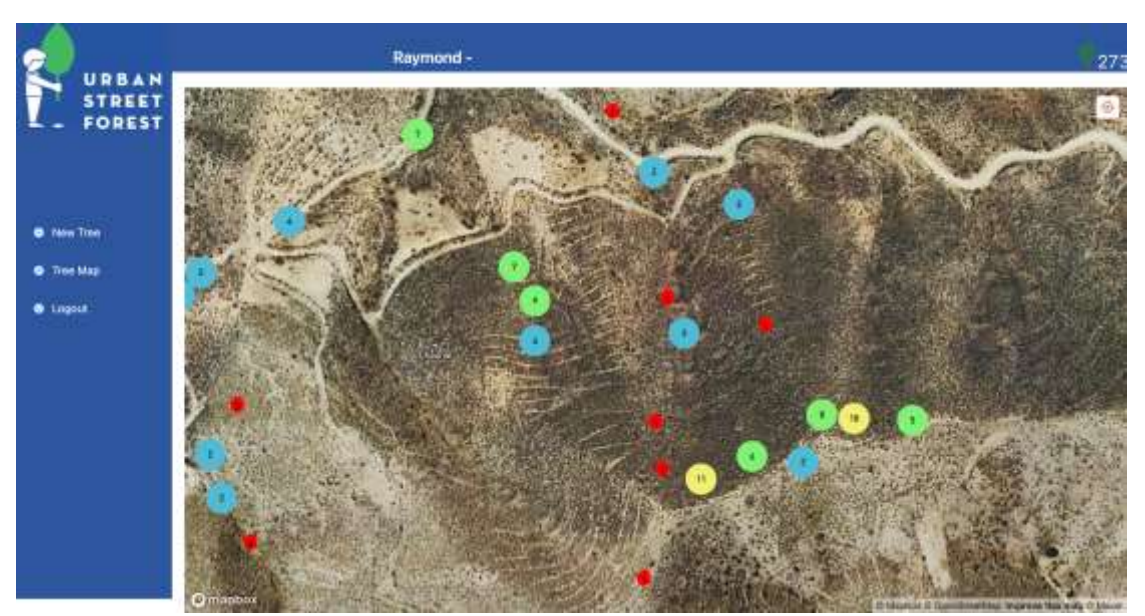
Detail of one of the areas marked with pink circle from the map above