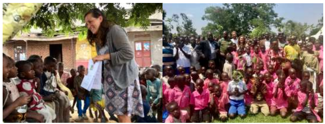
Teaching in Kikorongo village and our visit to one of the Tororo district schools in Uganda

Video link: <a href="https://www.youtube.com/watch?v=uRFewB46G4A">https://www.youtube.com/watch?v=uRFewB46G4A</a>